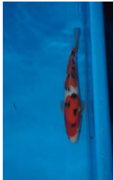
Size 2 Sanke-Don Chandler