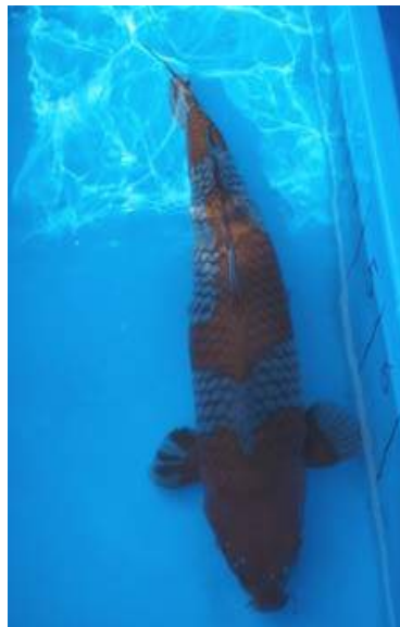
Size 6 Kawarimono-Nelson Castro