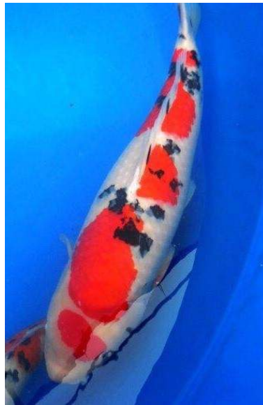
Size 7 Sanke—Nelson Castro