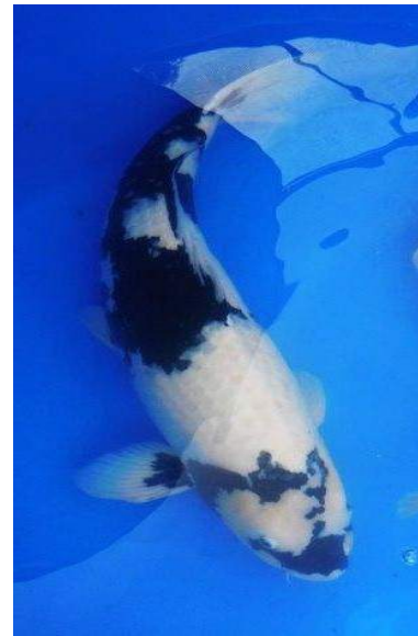
Size 7 Utsurimono-Nelson Castro